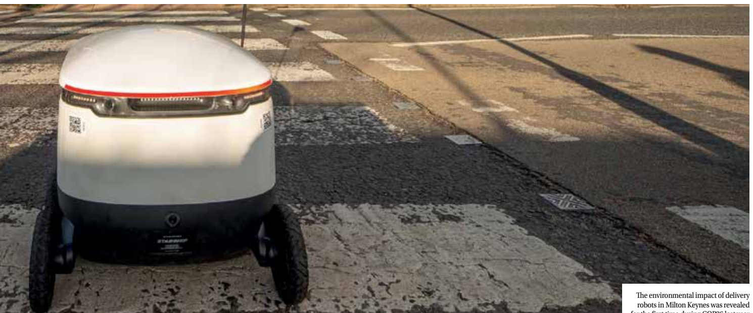
The environmental impact of delivery robots in Milton Keynes was revealed for the first time during COP26 last year