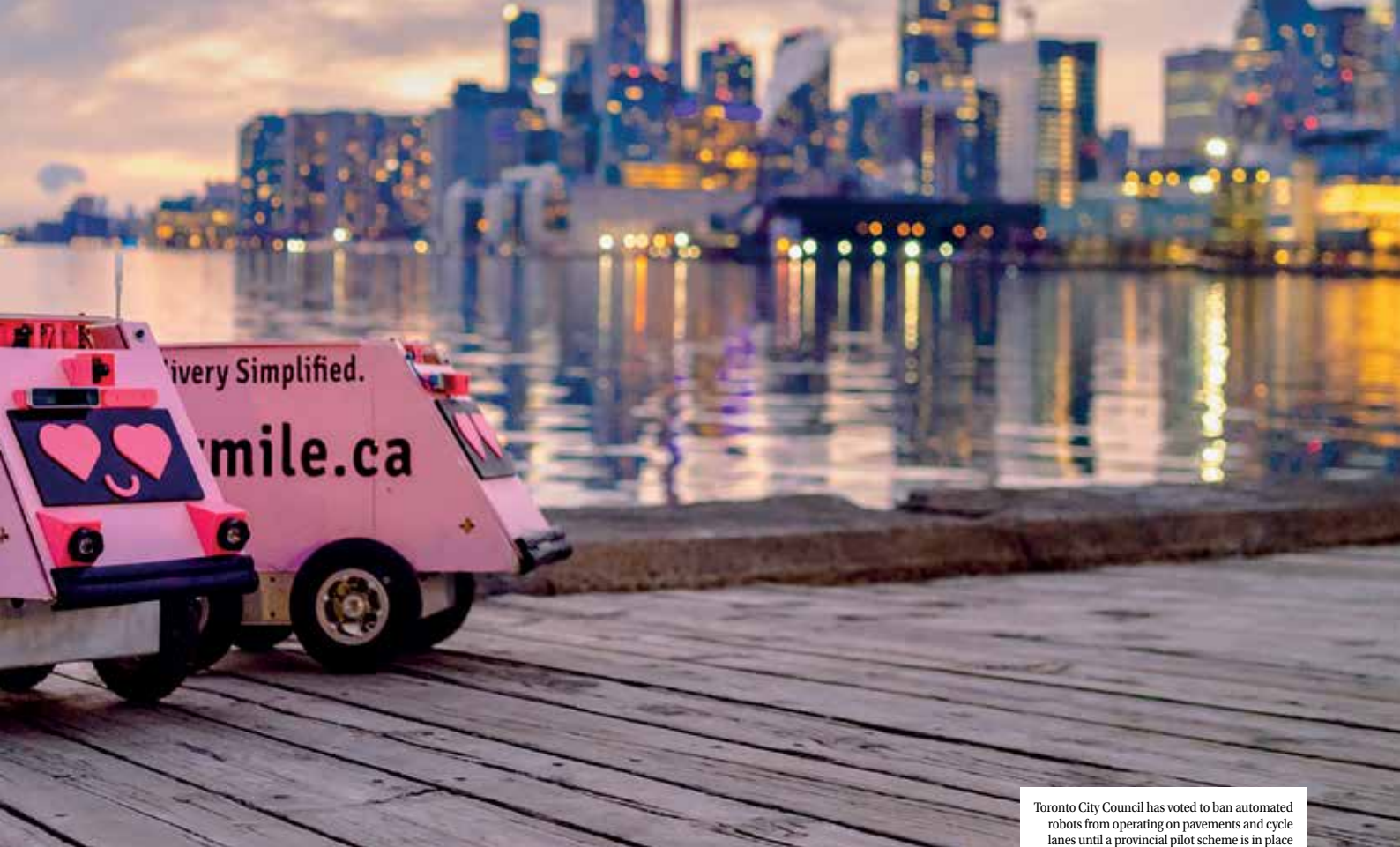
Toronto City Council has voted to ban automated robots from operating on pavements and cycle lanes until a provincial pilot scheme is in place

Robotics a permit to trial the technology in August 2019. And in February 2022, Ottawa's transport committee announced that so-called 'micro-utility' devices would not be permitted on roads, sidewalks, bike paths or any other city infrastructure.