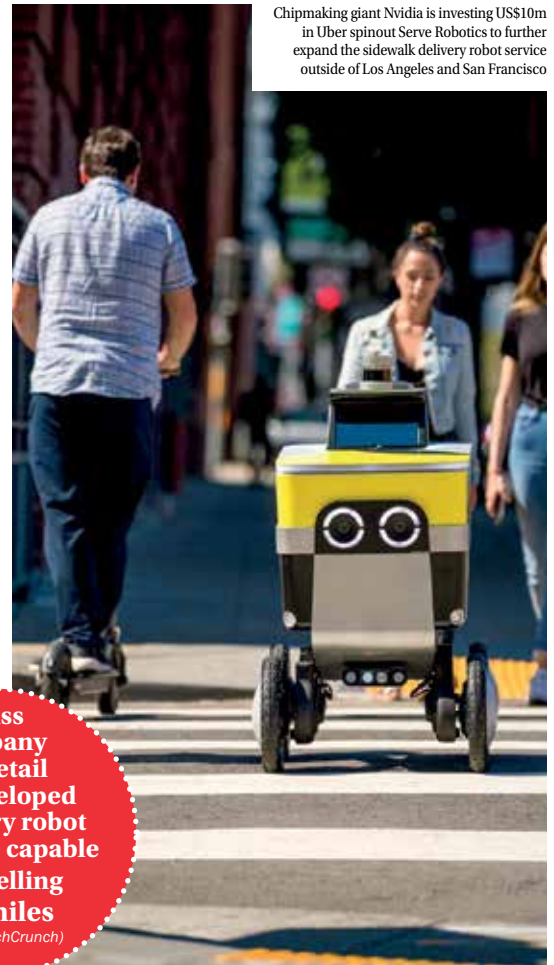
Chipmaking giant Nvidia is investing US$10m in Uber spinout Serve Robotics to further expand the sidewalk delivery robot service outside of Los Angeles and San Francisco